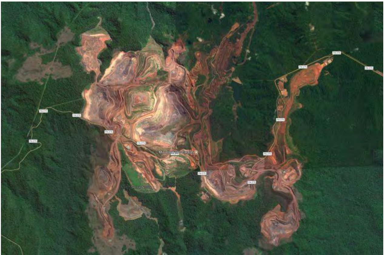
The Carajás Mine in Pará state is the largest iron ore mine in the world.

On August 30th a federal judge issued a preliminary decision ( liminar ) suspending the decree and directed that the matter should be decided by the National Congress. However, the National Congress is presently dominated by representatives with a decidedly anti-environmental stance (see here , here and here ). In addition, preliminary judicial decisions such as this are easily overruled by interested parties, such as the presidential administration, by seeking out friendly judges to issue a counter decision. This occurred many times when decisions halting construction of dams like Belo Monte were overturned within a few days.