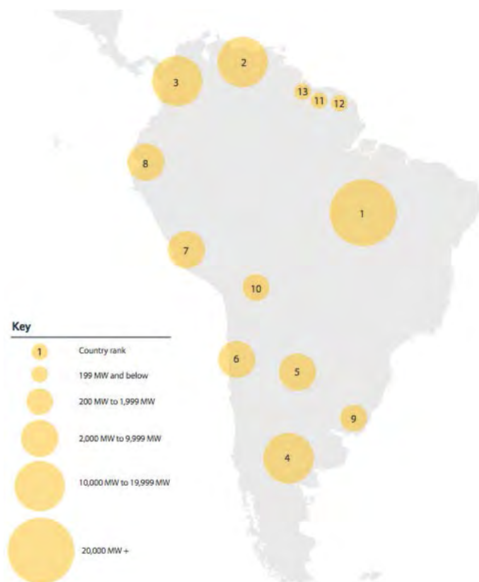
Image 1. Installed capacity in South America

Source: International Hydropower Association. 2018. Hydropower Status Report: Sector Trends and Insights . London: IHA.